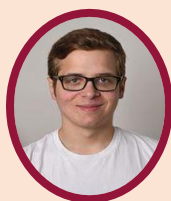
Xavier Koch Communication