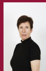
Photo credits :